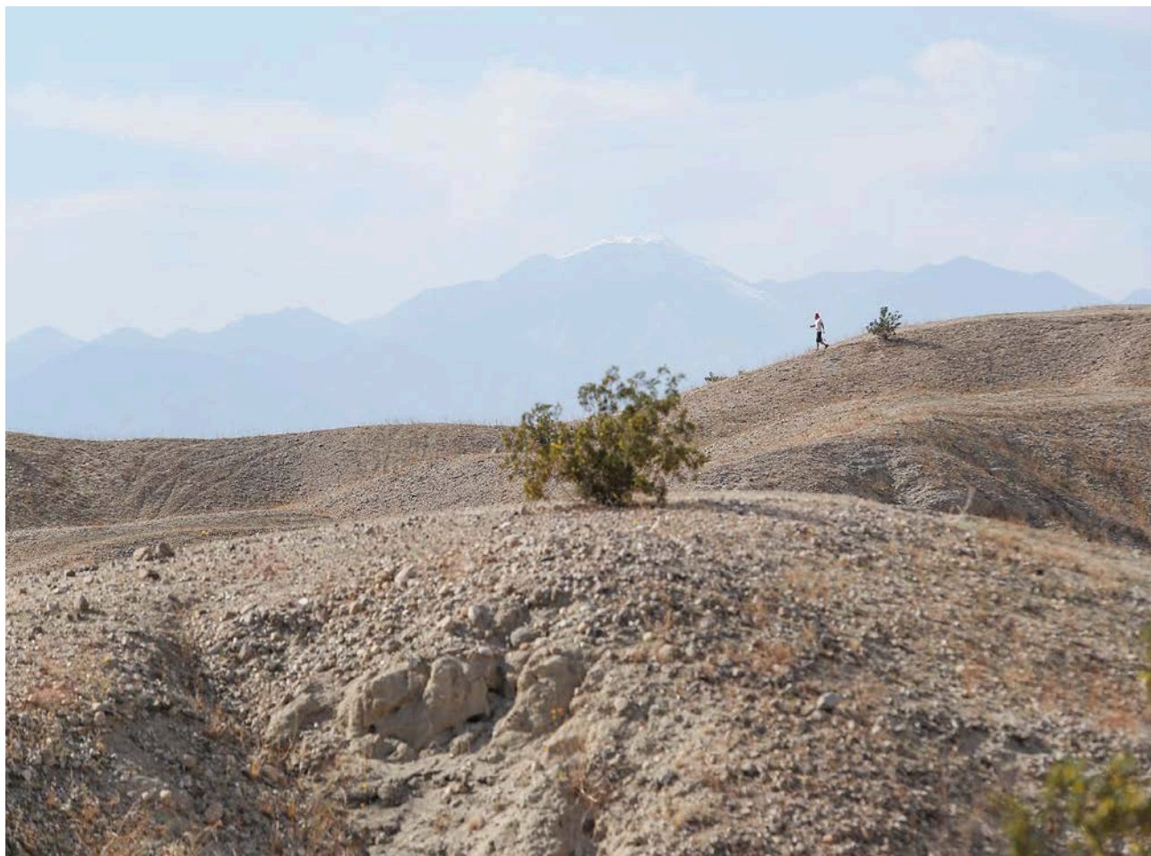
A hiker walks along the Indio Hills Badlands hiking trail in north Indio, March 6, 2020.