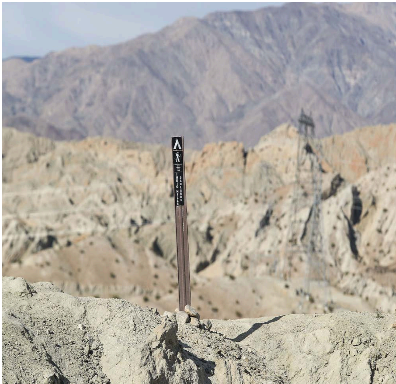
Signs guide hikers in the right direction on the Indio Hills Badlands hiking trail in north Indio, March 6, 2020.