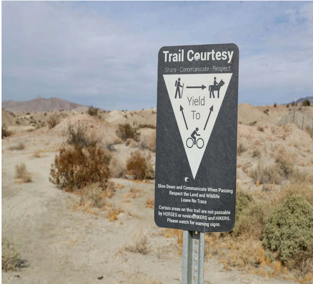
A sign about trail courtesy informs the public at the Indio Hills Badlands Trailhead, November 20, 2020.