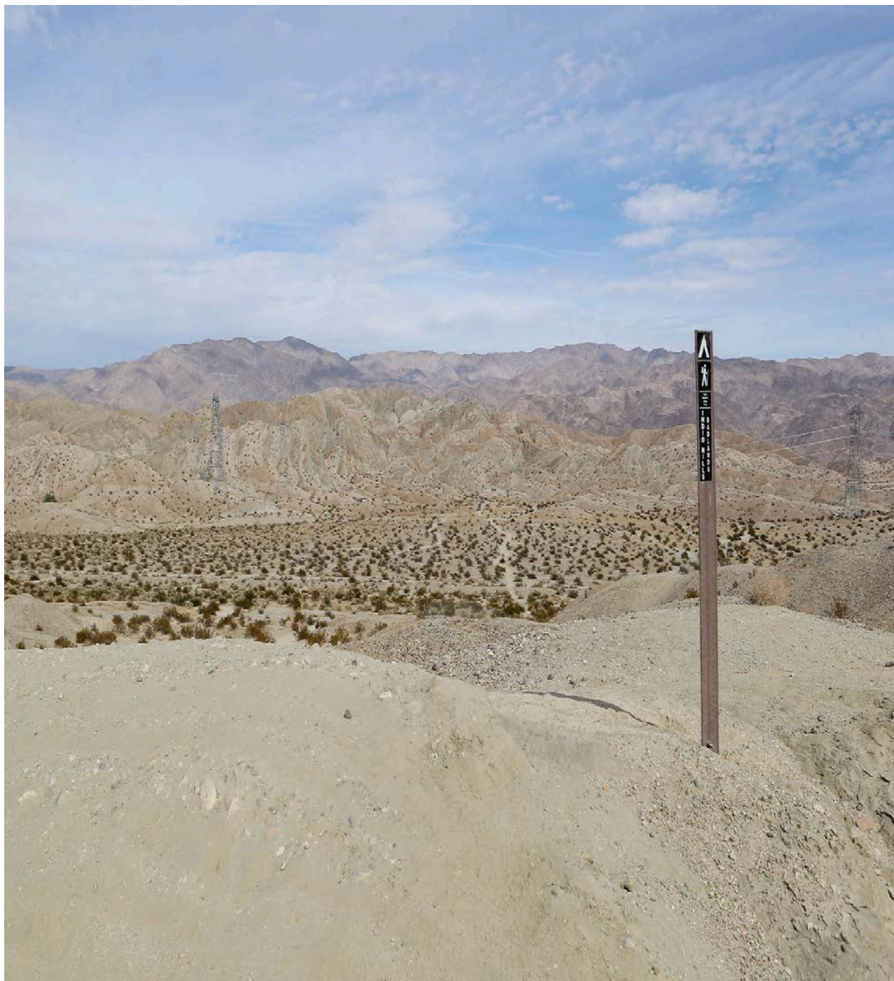
The Indio Hills Badlands Trail, November 20, 2020.