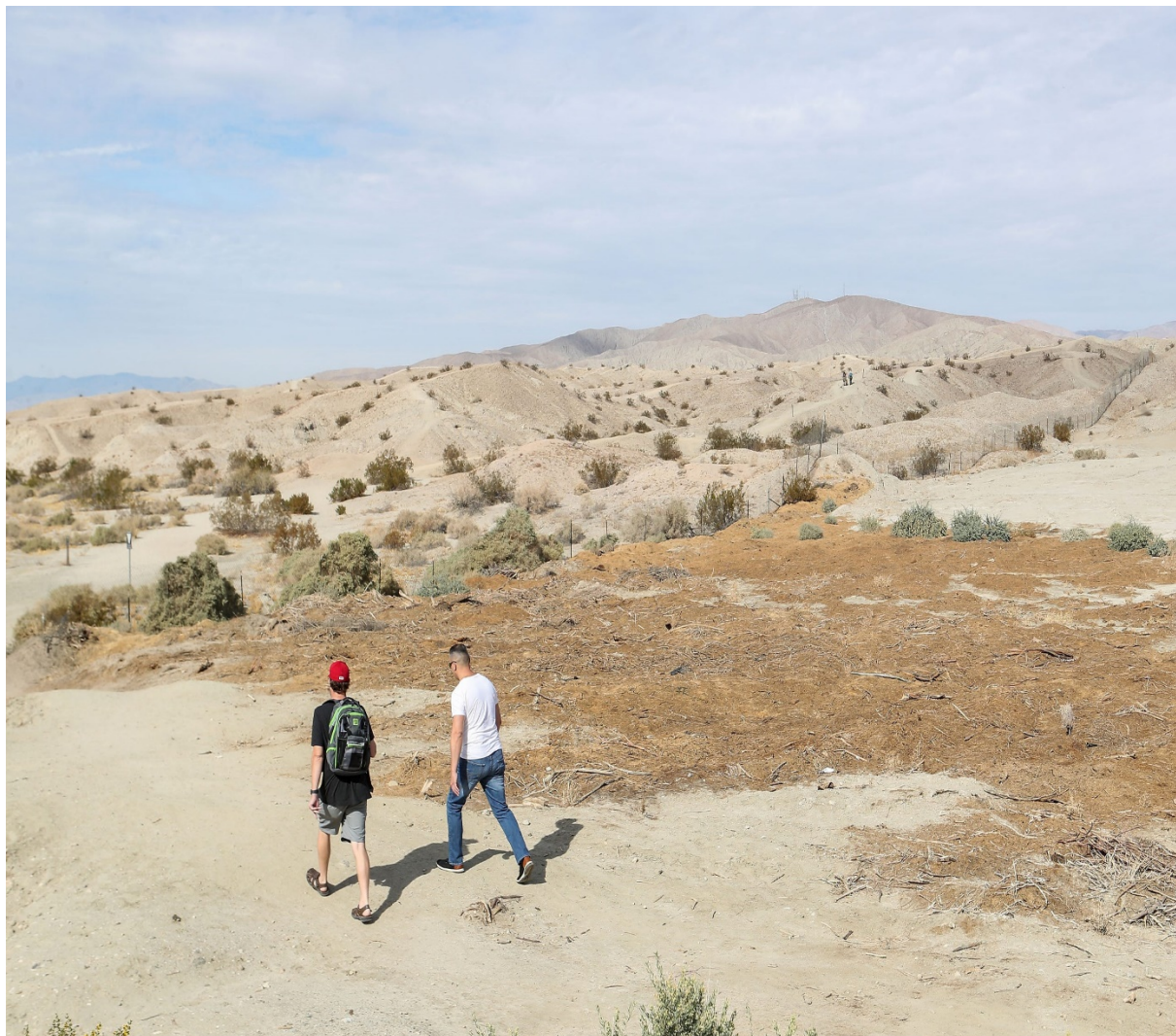
A couple hikers access the Indio Hills Badlands Trail in north Indio, November 20, 2020.