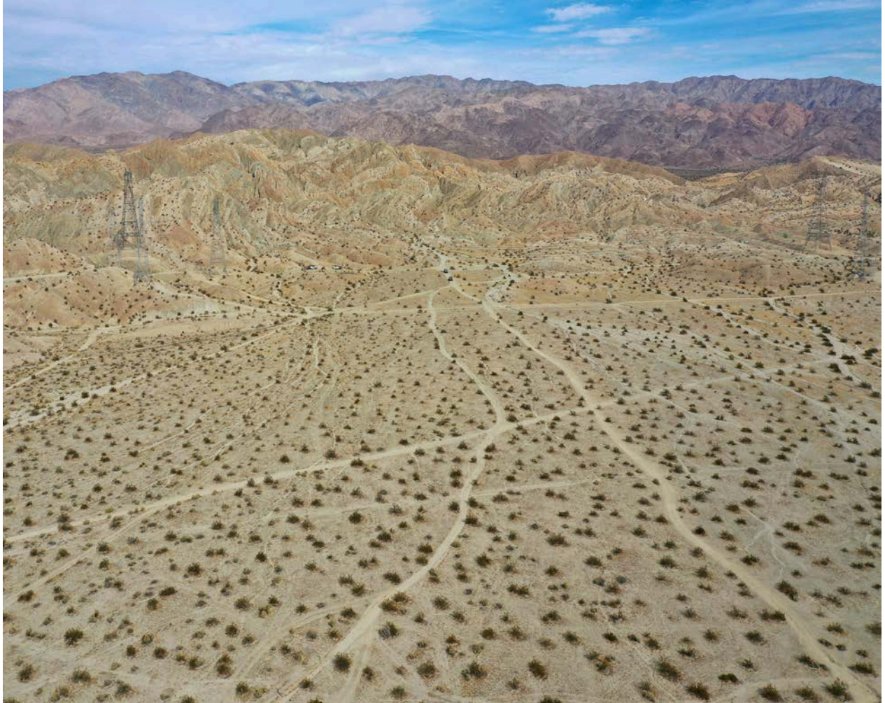
The Indio Hills Badlands Trail runs north toward the foothills of north Indio, Friday, November 20, 2020.