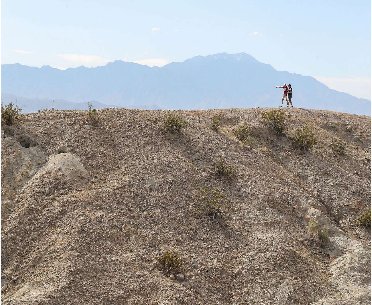
Hikers walk along the new Indio Hills Badlands hiking trail in north Indio, March 6, 2020.